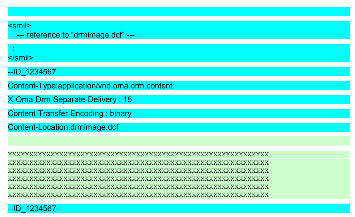
Example 4: Multimedia message with DRM Separate Delivery protected content