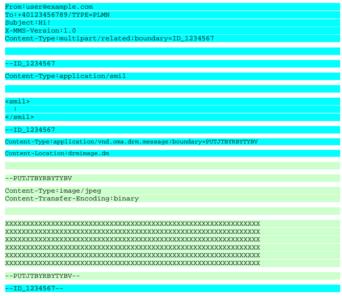
Example 3: Multimedia message with DRM protected content

Example 3 below shows the textual representation of a multimedia message with a forward-locked media object (a jpg image).