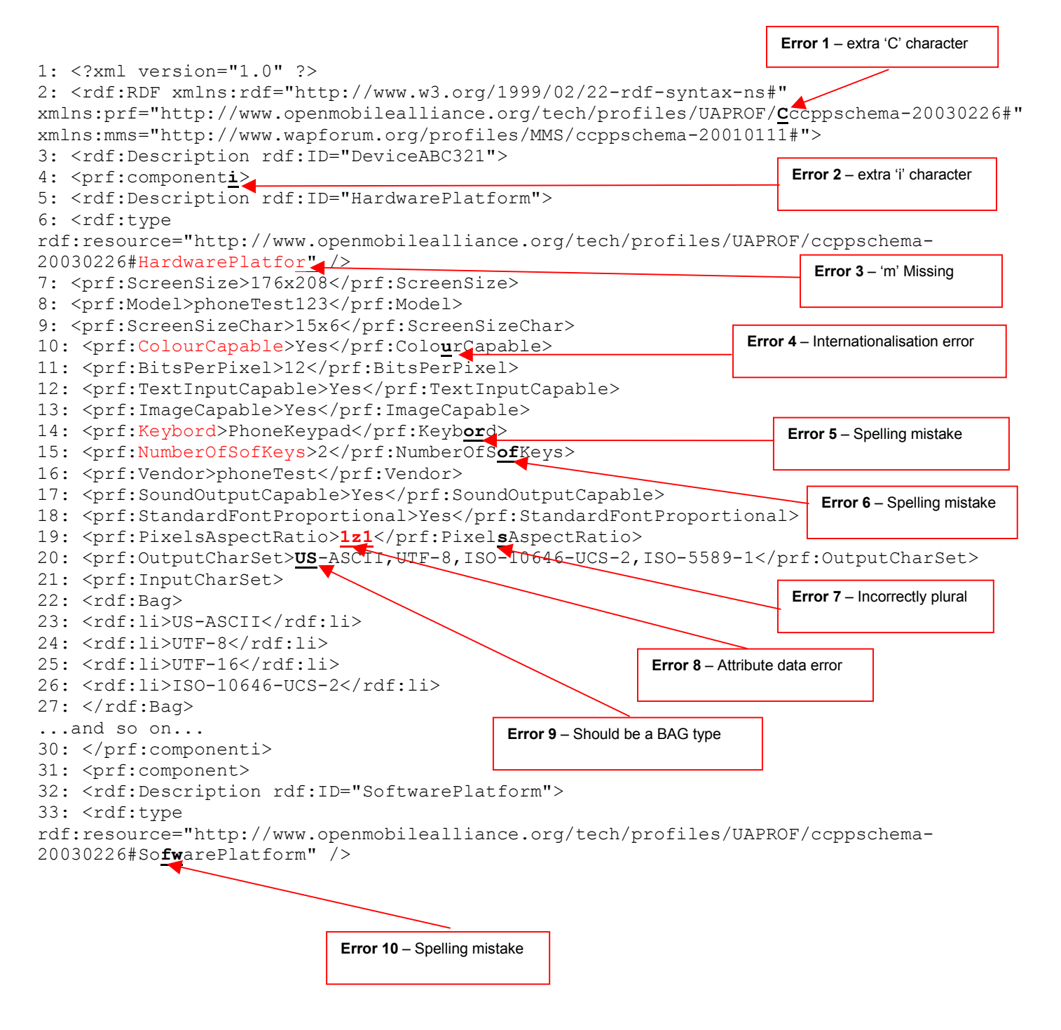
Figure 1: Example of an erroneous UAProf