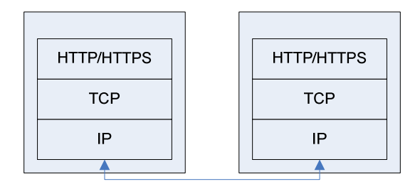
Figure 2: Protocol Stack for Back-end Interface of File Delivery

The protocol stack shown in Figure 2 SHALL be used for file delivery over back-end interfaces FD-1 between CC and FA and FD-2 between FA and FD. For secure operation over either of these backend interfaces, the entities implementing the interface SHALL support HTTPS, where HTTPS SHALL be based on SSL3.0 [SSL30] and TLS 1.0 [RFC2246].