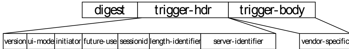
Figure 2. Format of the General Notification Trigger Message (Package#0)

The following figure describes the format of the General Package #0.