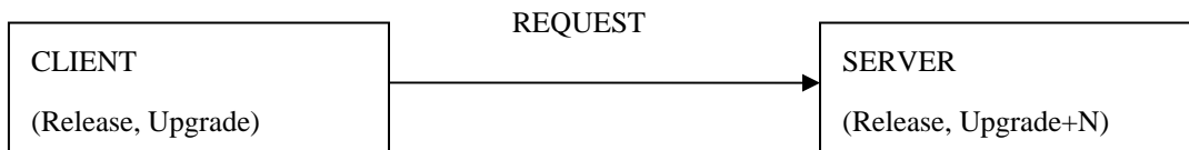
Figure 1 Clients using older versions of the API

APIs evolution should offer backwards compatibility for clients using older versions of the API. Backwards compatibility should be guaranteed for previous upgrades (i.e. minor revisions) within the same release (i.e. major revisions).