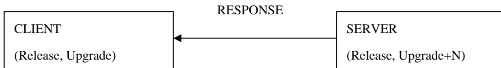
Figure 3 Upgraded servers returning a response to legacy clients