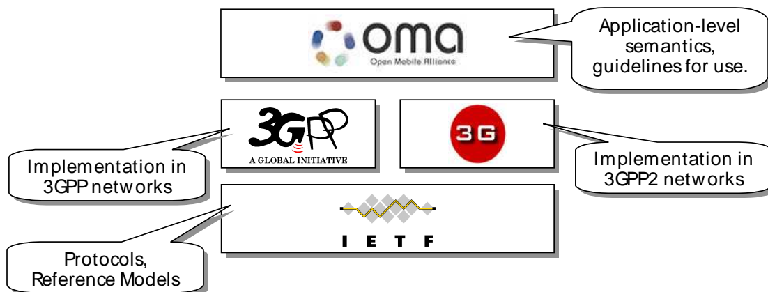
Figure 1. Presence specification layers

OMA's role is to create application level specifications for Presence Service. This includes Presence Information semantics and guidelines for presence applications (see Figure 1). These specifications shall be agnostic to the underlying network technology, be it specified by 3GPP, 3GPP2, or other organizations.