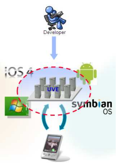
Figure 1: OS-Independent UA scenario

In an attempt to solve the problem this work items attempts to optimize the current application usage model by providing a unified platform (cloud computing platform) which can host various applications (UAs), enabling different content and services, remotely in the cloud and provide them to the user using virtualization techniques (cloud computing). This will aid end-user to use an UA irrespective of the platform they are using with consistent user experience as compared to using UAs hosted locally on the device.